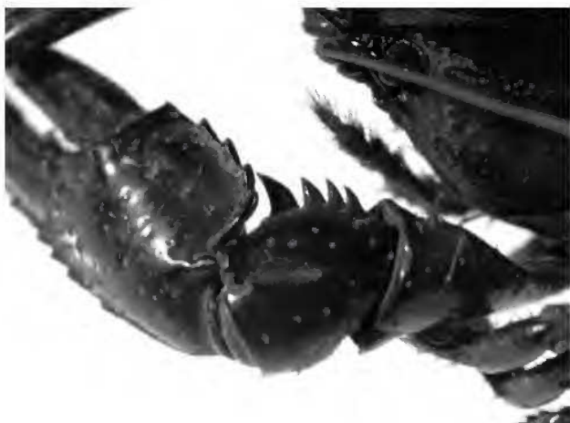
Figure 3. Euastacus mirangudjin n.sp. Dorsal view of chela (paratype) showing 4 mesial carpal spines. All other specimens examined bore 3 mesial carpal spines.

2 Lii spines on somite 2 of large female specimen (released) (OCL 37 mm); D-L spines absent on most specimens, although present and minute on large female; D spines and abdominal boss absent; abdomen width/OCL = 0.5–0.52; OCL/total length = 0.42. Tailfan —telsonic and uropodal marginal spines absent; telson length/OCL = 0.33. Chelae —elongate. Dactylus —dactylar basal spines absent; 1 apical mesial dactylar spine; 3–4 medium to large and blunt spines above dactylar cutting edge, extending to midlength of chela gape (apical on paratype); dactylar